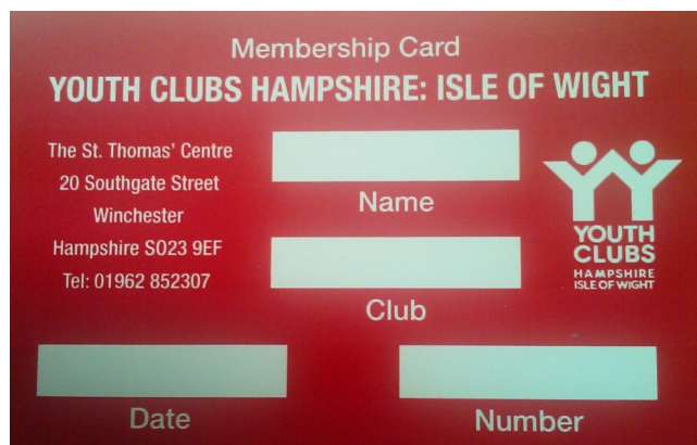
Sample Membership Card

Return to: Membership Cards Youth Clubs Hampshire & IOW The St Thomas Centre 20 Southgate Street Winchester SO23 9EF